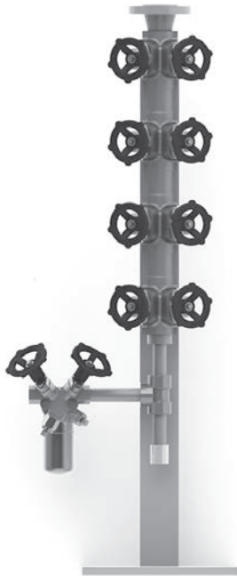
Steam Distribution Manifold

Shown are typical locations for Armstrong manifolds. The many manifolds in chemical/ petrochemical plants consume valuable floor space and often block movement among the units. Operating costs are high, and installation requires expensive custom fabrication on site. Clearly, a prefabricated manifold permitting standardization of components offers substantial savings over conventional units. Shaded products are available from Armstrong. Call or consult your Armstrong Representative if additional product details are required.