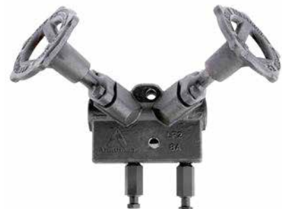
TVS 5000 Trap Valve Station