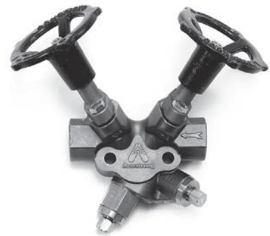
TVS 4000 Trap Valve Station